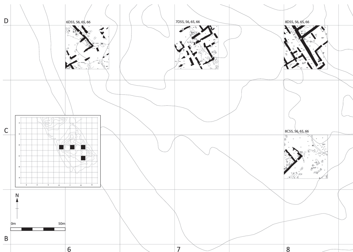
Fig. 2. Plan of architecture from surface cleaning of the South Mound, Abu Salabikh.

cus of excavation by both the 1960s Chicago team and the 1970s-1980s work directed by Nicholas Postgate (Postgate 1990, 104–106). At the conclusion of the 1989 season, one late afternoon we walked over the South Mound after a rain storm. Differential drying of deposits rendered visible the plan of a large building, situated between previously scraped and planned architecture in squares 7D and 8C. We were able to make a measured sketch of the visible walls and that plan is here published for the first time (Fig. 1). The building covers an area of at least 50 by 50 m, and has features characteristic of an Early Dynastic III palace, in particular the parallel double exterior walls, clearly visible on the northwest and southwest side of the building. A wall return at the northwest corner may suggest that this structure is one of a complex of palaces or structures, as attested in the new evidence from Kish published by Stone and discussed above (Stone 2013). Rooms within the enclosing wall were only partly visible, as depicted on the plan, and occasional spreads of baked brick (flooring?) were also visible within the central area of the building.